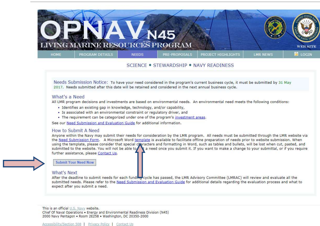
Figure 2. Need Submission Webpage.

All needs must be submitted via the submission form on the LMR website. On the LMR website, the Needs tab can be found at https://epl.navfac.navy.mil/lmr/Needs.aspx . Once on the Needs page, click on the Submit Your Need Now button (as shown in Figure 2 ).